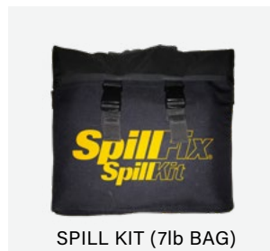
SPILL KIT (7lb BAG)

SKU: SPLCW-4GB Volume: 4 Gallons / 15 Liters Weight: 7 lbs (US) / 3.175 Kg Per Pallet: 64 / 48 with Brooms Oil Absorption: 2.1 Gallons (approx.)