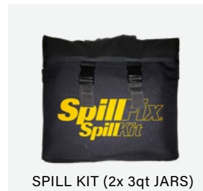
SPILL KIT (2x 3qt JARS)

SKU: SPLK-175B Size: 18" x 18" x 7.5" Weight: 12 lb / 5.5 Kg Per Pallet: 32 (8 Cartons) Oil Absorption: 4 Gallons (total approx.)